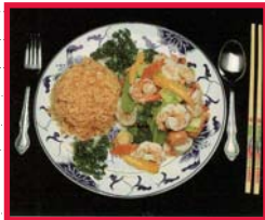
SHRIMP WITH VEGETABLES